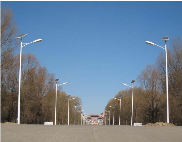
The Lingqiu County Solar Illumination Project in Datong of Shanxi Province