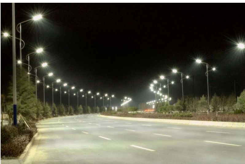
Shanxi Linfen fourteen Road Illumination Project(3.5km)

Pole Height:12m, distance between two lights:35m, road width:64m