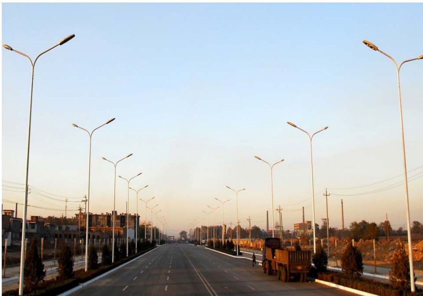
ZhuGang road Streetlights Illumination Project in LinFen city