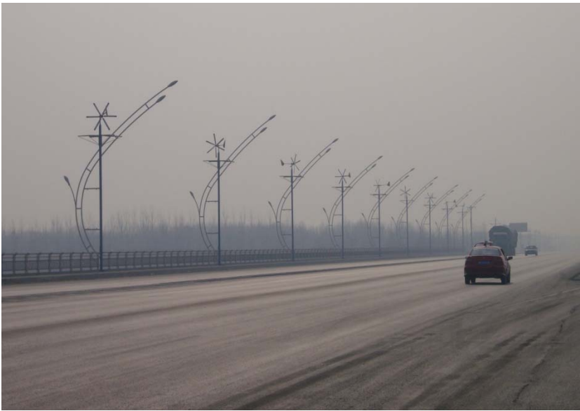
Wind-solar Hybrid Streetlights Illumination Project in Northeast of Xingtai City