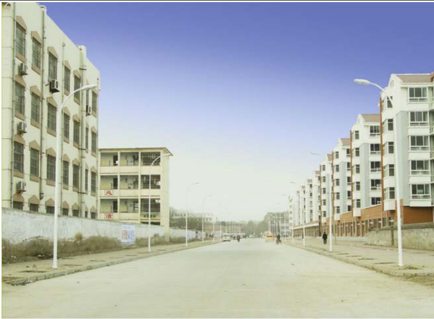
Puyang LED Street Lighting Project