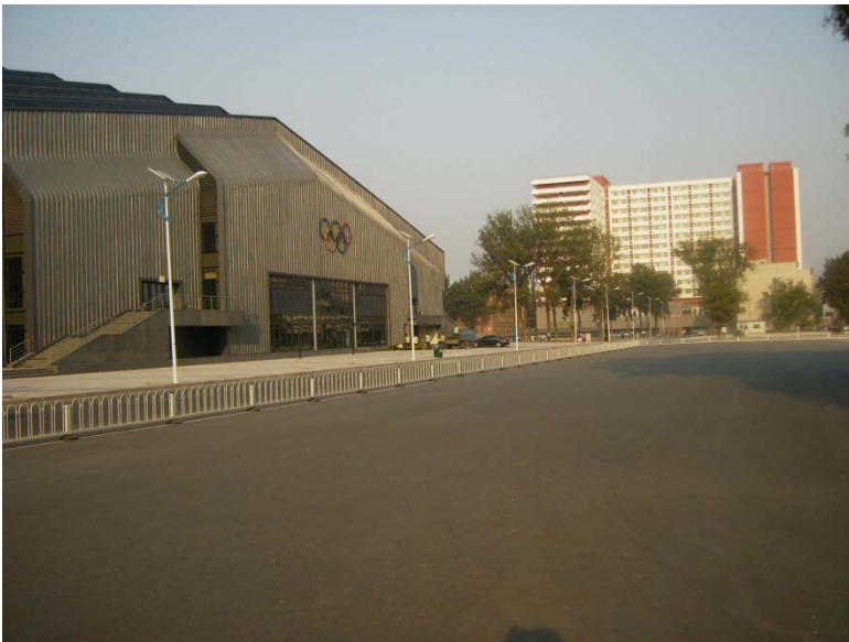
The Solar Illumination Project in Beijing Olympic Wrestling Venue