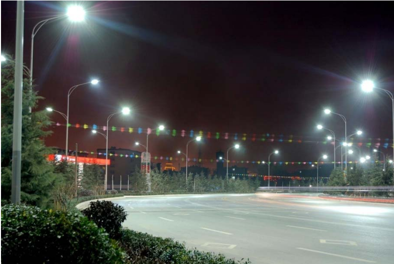
Shanxi Linfen Linfu Road Illumination Project(5km)

Height pole:12m, distance between two light: 35m, road width:62m