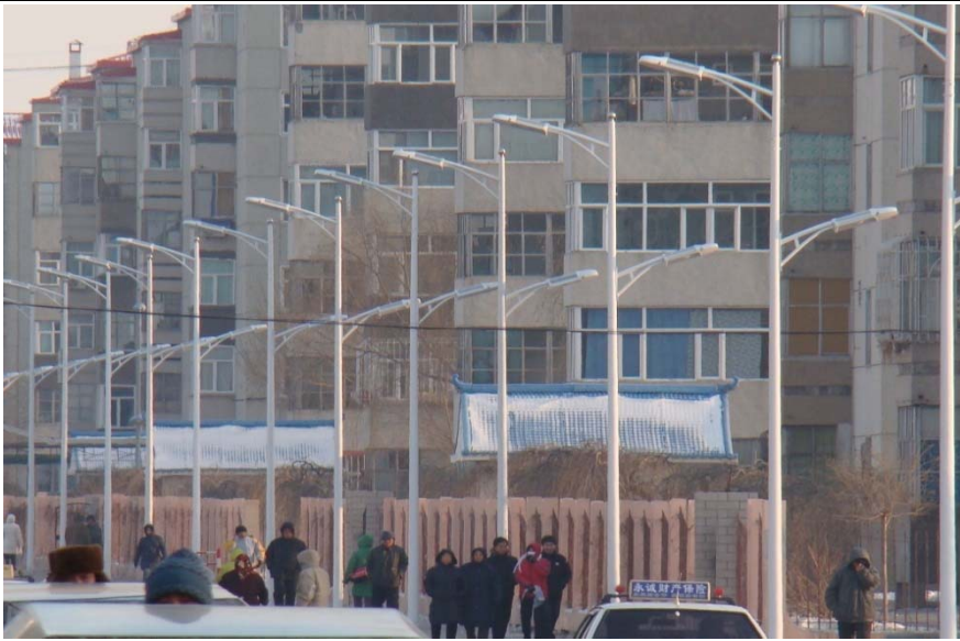
Streetlights Illumination Project in DaQing city